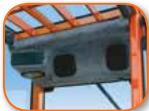
Radio Ready Kit†