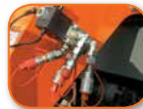
2nd Auxiliary Hydraulics†