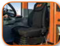
Air Ride Seat†