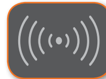
Reverse Sensing System*