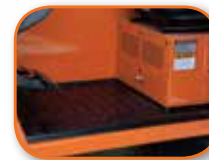
Molded Floor Mat†